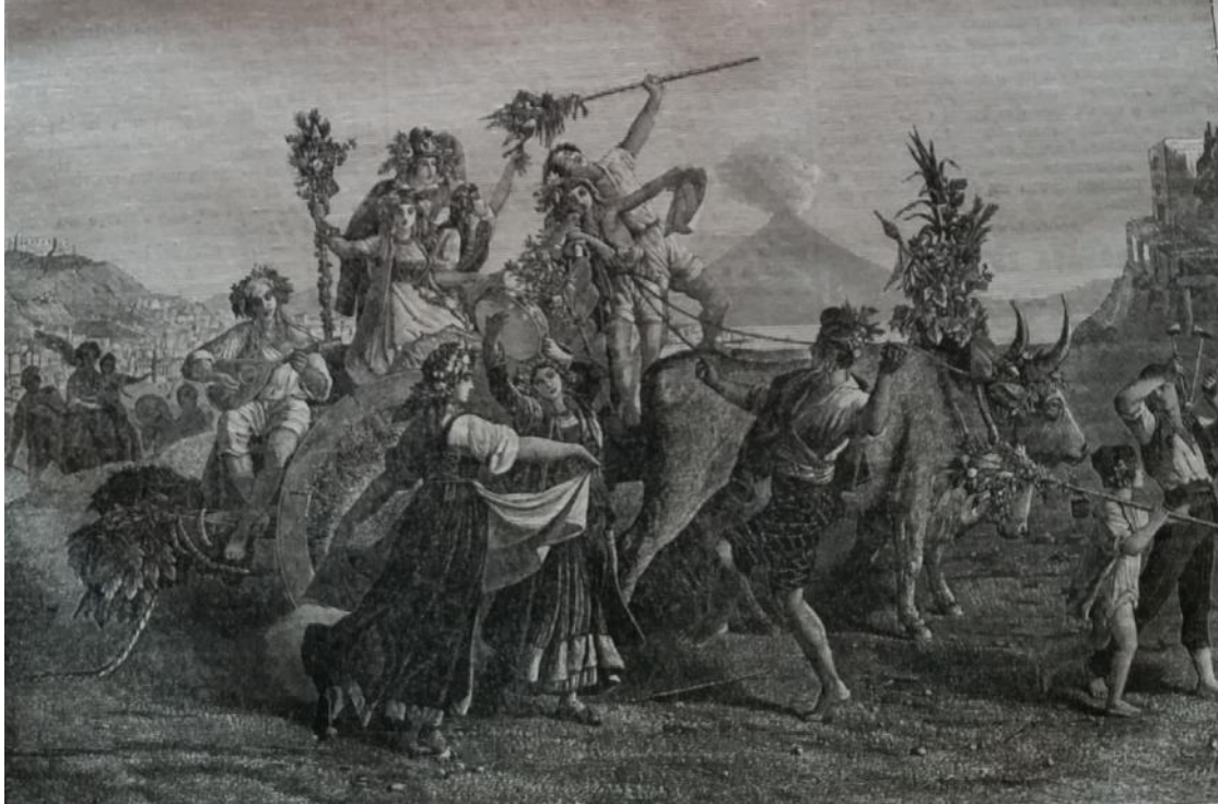
Img. 1 Grape Harvest near Neaples (Louis Léopold Robert) 147