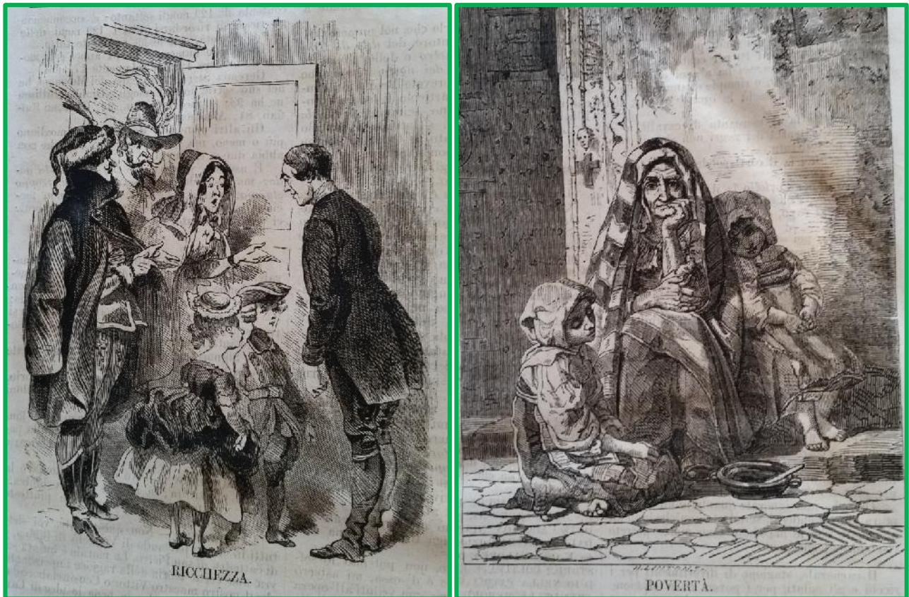
Wealth and poverty 1