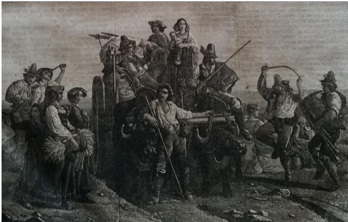
Img. 2 Harvest in the Maremma pontina (Louis Léopold Robert) 148