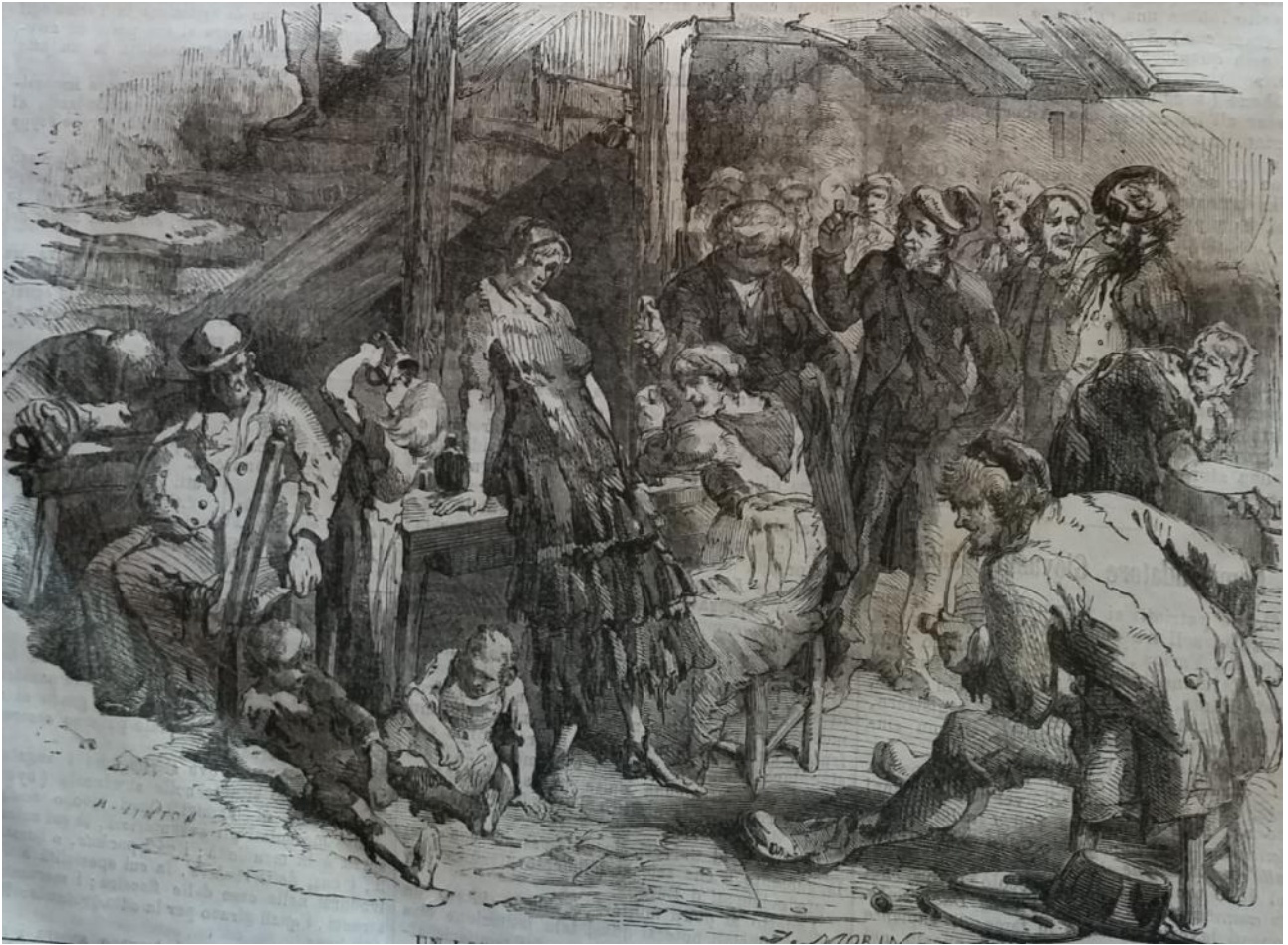
Img. 3 London Lodging-House 149